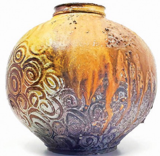
Cover: Ian Bassett Spotlight: Mesut Özkürk Clay Culture: SodaPoslum Tech: Testing Clay Bodies

Follow us on social media to stay in the know!