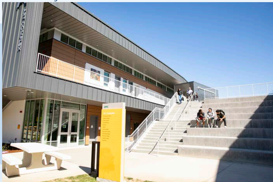
DVC's Art Building